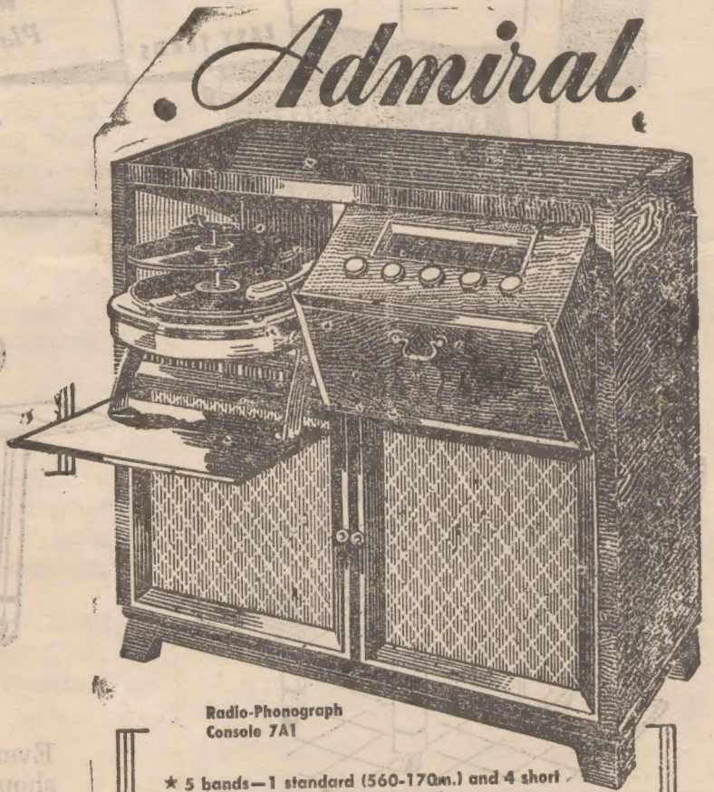
Radio-Phonograph Console 7A1

Tickets will go on sale about June first, but you can visit the "Electra" Stores now for a demonstration on these high quality prizes.